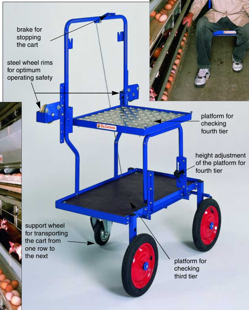
Inspection cart for cage systems up to 4 tiers