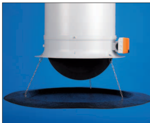
Light plate, black, Code No. 60-40-4261 Ø 1.4 m; rain cover with additional light protection