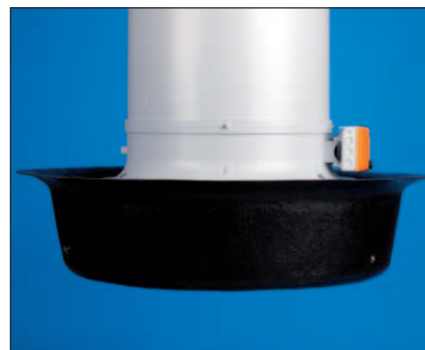
Light pan, black, Code No. 60-40-4262 Ø 1.35 m; to shut out any light