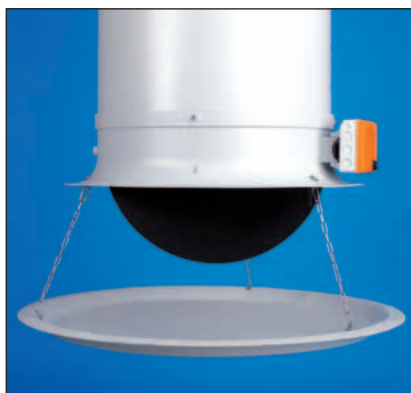
Drip plate plastic (grey), Code No. 60-40-4060 Ø 1.1 m; rain cover