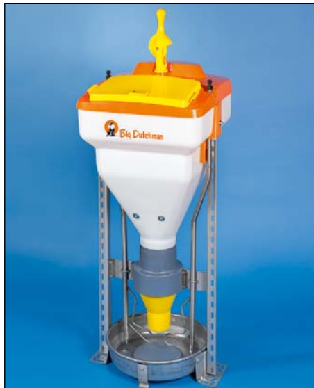
Swing for piglets