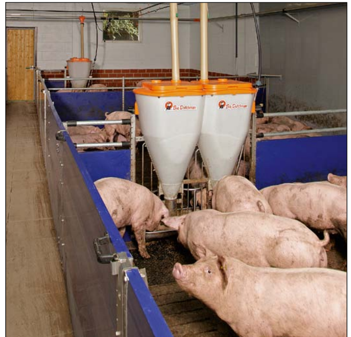
Group pen final finishing equipped with PigNic-Jumbo and divided door