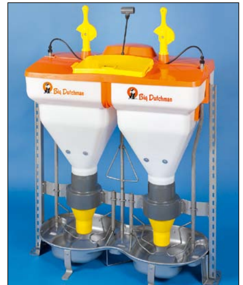
Swing-Jumbo for finishing pigs